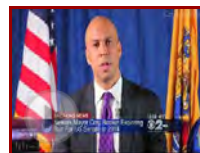
Newark Mayor Cory Booker T...