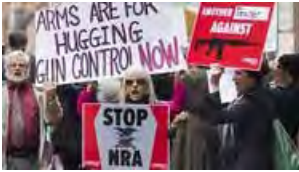
Daum: Finally, it's time for gun control