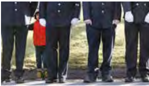
A knee-jerk plea for gun control? Absolutely!