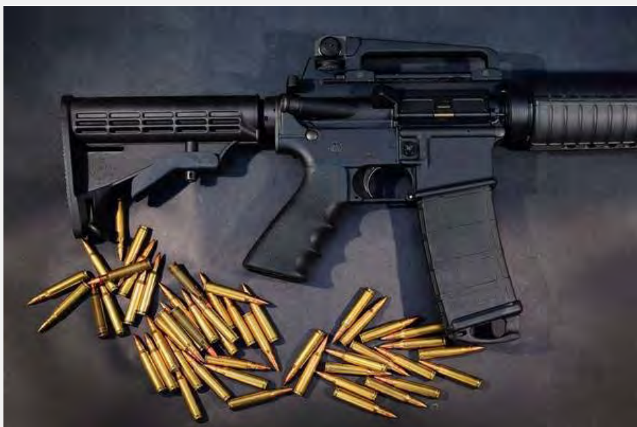
An assault weapon similar to the type used in the Newtown, Conn. shooting. (Joe Raedle / Getty Images / December 18, 2012)