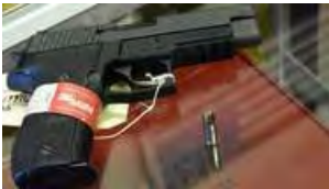
Where gun violence is concentrated: It's not where you might think