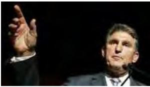
Let gun lovers lead the charge on gun control