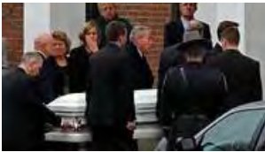
Photos: Massacre at elementary school in Newtown, Conn.