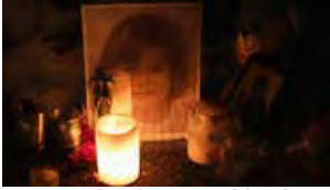
Newtown hits home, and hard