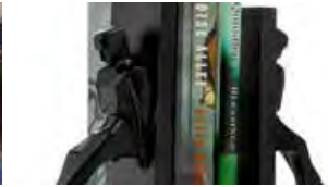
Photos: 11 last-minute gifts for book lovers