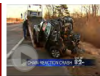
Investigation Continues As Lo...